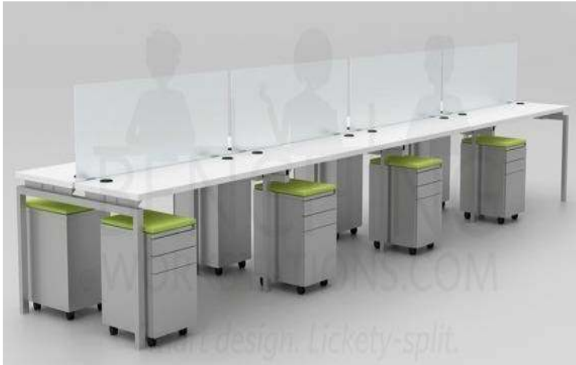
Shown in Electric White