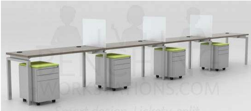
Shown in Shadow Elm